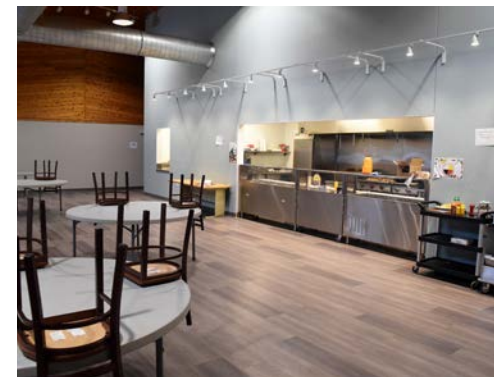
The dining area at Ahnji-Be-Mah-Diz Recovery Center.