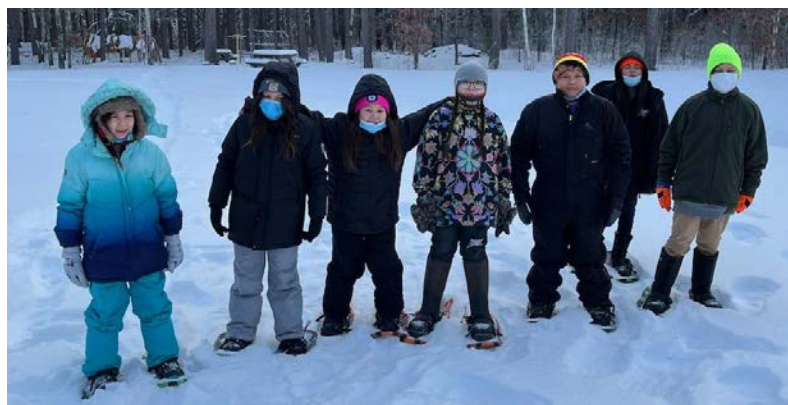
▲ The Niigaane students had a wonderful time snowshoeing at Bug O Nay Ge Shig School. Students spotted many rabbit trails. Their next snowshoeing adventure will involve setting snares to get a few rabbits for soup!