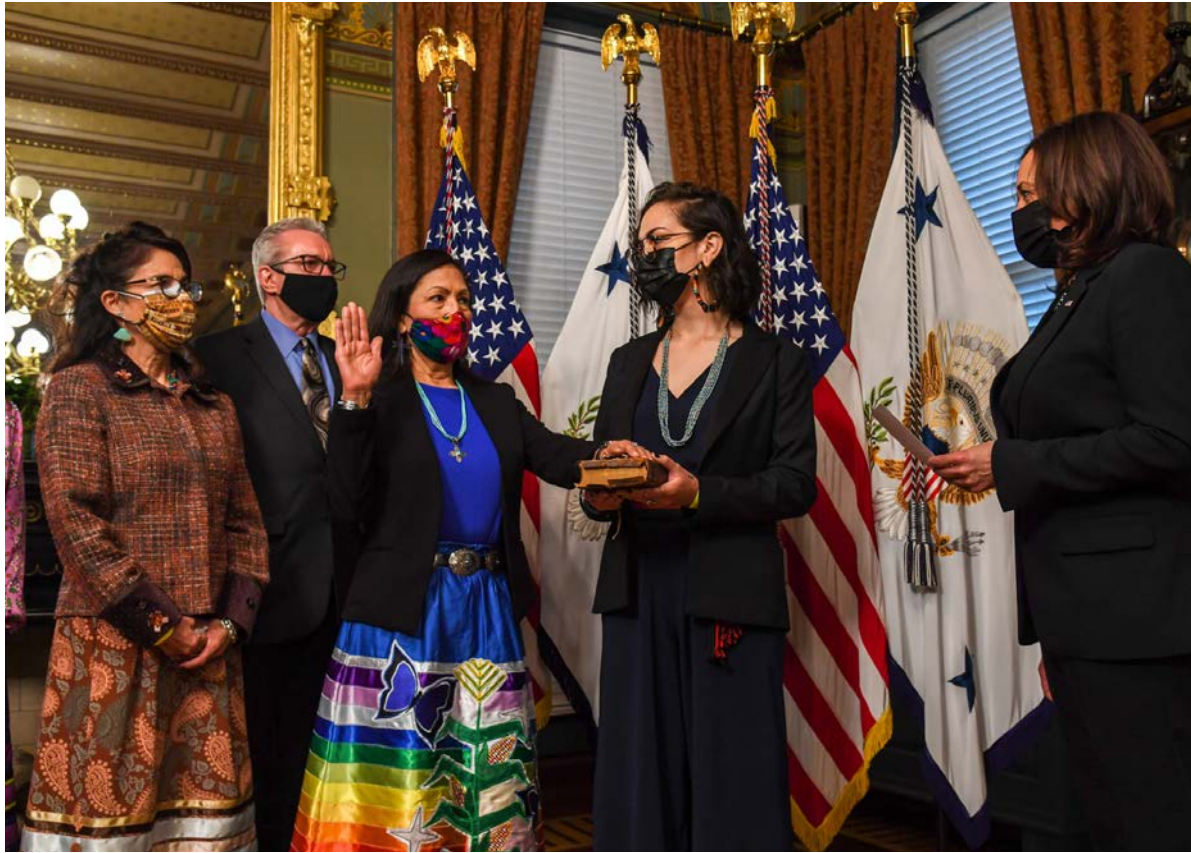
With her family by her side, Interior Secretary appointee Deb Haaland being sworn in by Vice President Kamala Harris Thursday, March 18, 2021.