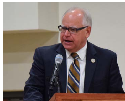
Gov. Tim Walz is rolling back COVID-19 restrictions his administration put in place as stats improve for MN.

The occupancy limit goes away for religious services and at salons and barbershops, but social distancing will still be required. The state is also rolling back restrictions on large venues, effective April 1.