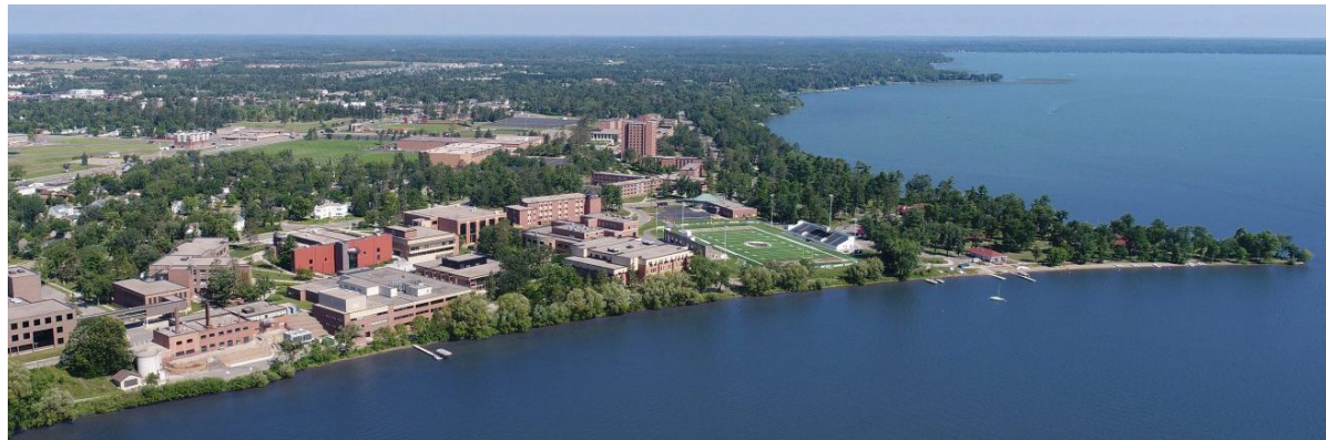
The Bemidji State Campus sits along the shores of Lake Bemidji.