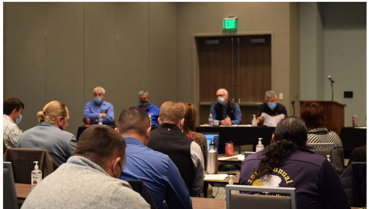
The Annual meeting between Cass County Officials and the Leech Lake Tribal Council was held at Cedar Lakes Casino Event Center in November. Officials met to discuss community needs in regards to law enforcement, roads and trails, human services and other critical areas.