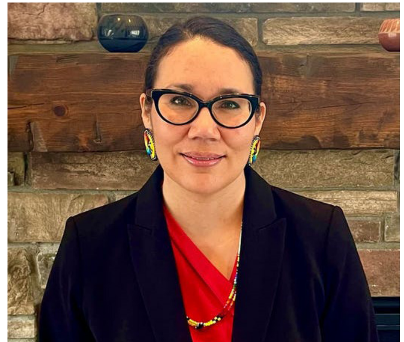
Judge Sarah Wheelock