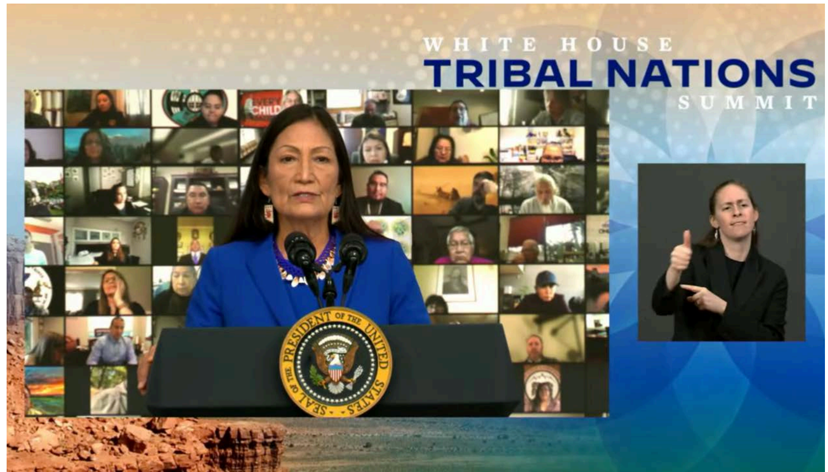
Secretary of the Interior, Deb Haaland speaks on the first day of the 2 day summit on November 15.

On November 15, 2021, President Biden signed an executive order directing the Departments of Justice, Interior,