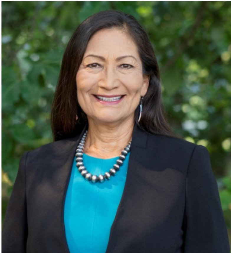
Interior Secretary Deb Haaland announced the new task force in a press conference November 19.