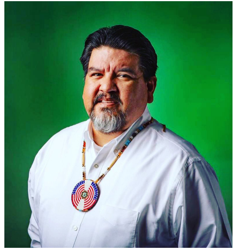
Newly appointed National Park Service Director, Charles Sams III.

Several states have passed legislation prohibiting the use of the word “squ*w” in place names, including Montana, Oregon, Maine, and Minnesota. There is also legislation pending in both chambers of Congress to address derogatory names on geographic features on public land units.