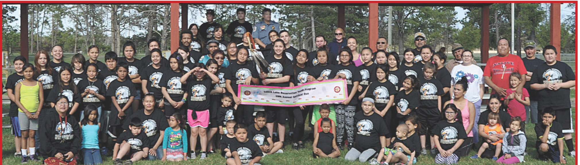
Participants of the Spirit Walk enjoying the weather as spring has finally sprung and brought warmer days to the area. "No winter last forever; No spring skips its turn!"

Sugar Point Community Center held Get Out the Vote for Remer School District's new facility