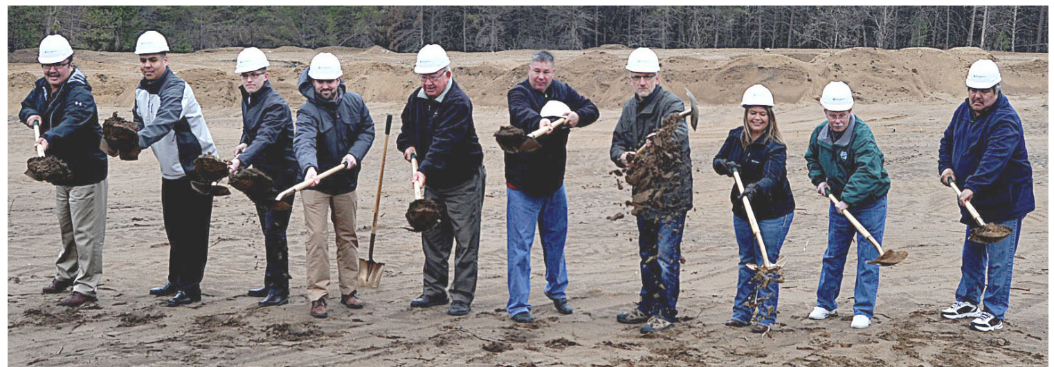
The ceremonial ground-breaking for the Assisted Care facility that will be located near IHS took place on the same day.

The Band had been examining the need for infrastructure improvements and government facilities for several years, as the Tribal administration offices and many of the other divisions are not centrally located, making access to services challenging. A broad based community planning process has been in place since 2006 that involves the various departments and divisions of the Tribal government, Tribal Council leadership, and Local Indian Councils (LIC) Representatives on this project.