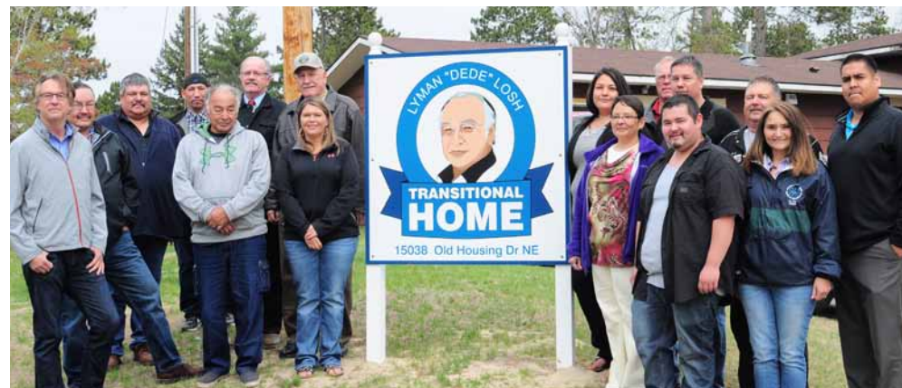
The Grand Opening of the Homeless shelter was on May 8, 2015

The Transitional Home has recently hired a shelter manager who will be managing the operations. The grand opening was held on May 8th, 2015. At this time, the shelter has hired enough shelter advocates to staff the shelter and with the final preparations families will be invited to stay at the shelter. The transitional home will provide a bed, meals, and other resources to individuals experiencing homelessness. Congressman Nolan said that, "The Leech Lake Band is to be congratulated for its visionary 10 year plan to end homelessness on and near the reservation - and in particular to provide for the children who will benefit so greatly from a better and safer start in life through this housing program. Hats off to the Band and to everyone involved!"