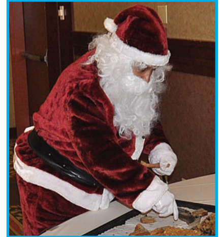
ELDERS CHRISTMAS DINNER - NORTHER LIGHTS CASINO & EVENT CENTER