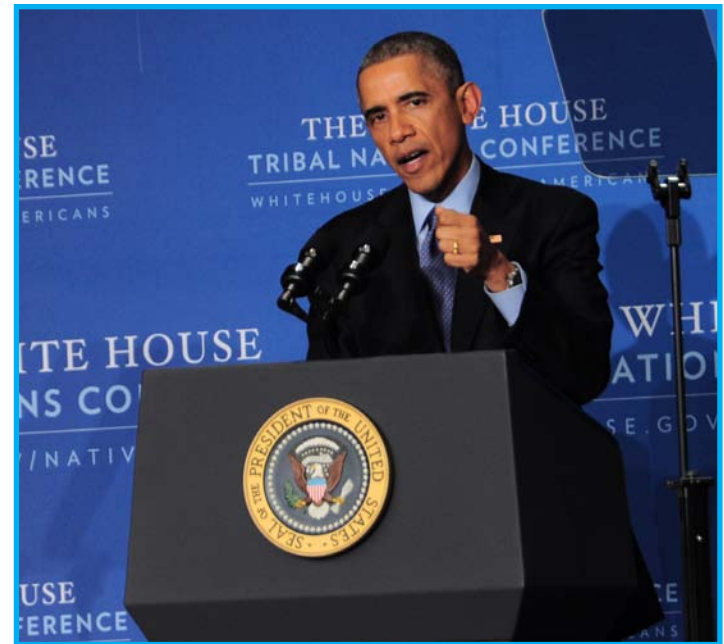
TRIBAL NATION CONFERENCE