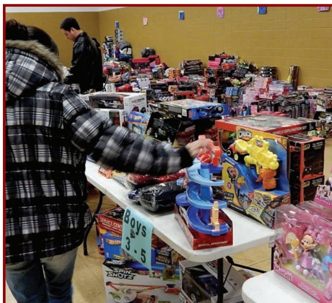
TOYS FOR TOTS- DISTRIBUTED TO EVERY DISTRICT CASS LAKE, SUGAR POINT, BALL CLUB