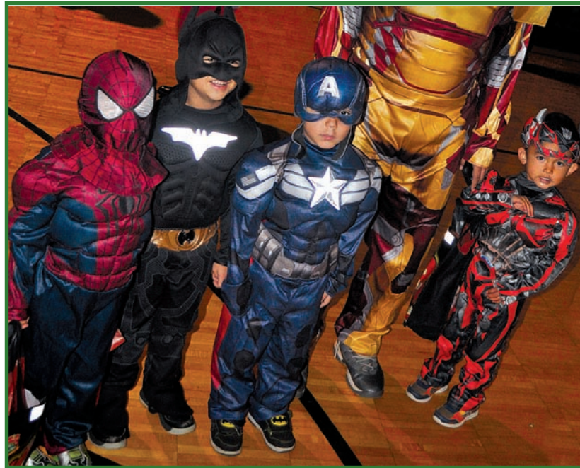
TREATS FOR TOTS - BOYS & GIRLS CLUB OF CASS LAKE