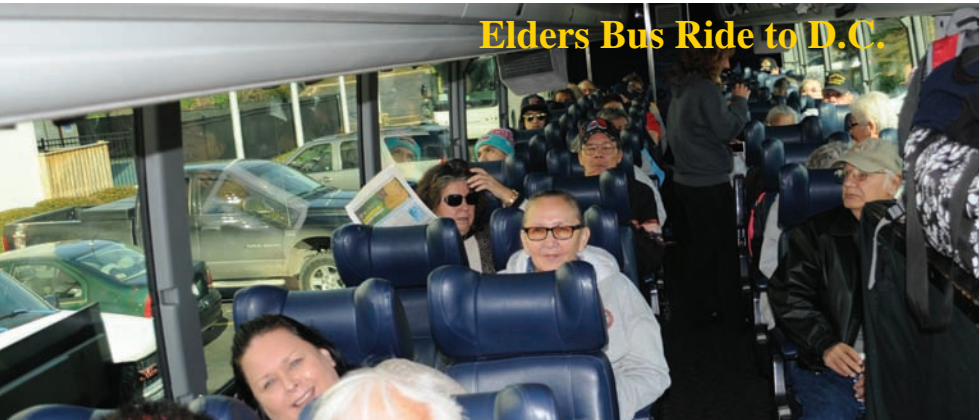
Tribal Nation's Conference.

There has been national coverage in the New York Times and the Huffington Post regarding the Bureau of Indian Education and the lack of attention that has been paid to these underachieving institutions, including Leech Lake's own Bug-O-Nay-Ge-Shig school, and it is nice to see these efforts having an effect.