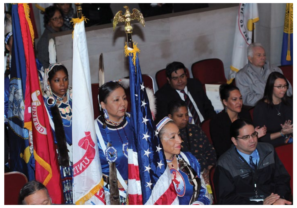
The Native American Women Warriors at the White House Tribal Nations Conference.