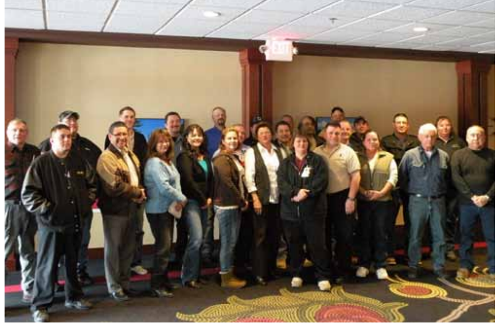
Key Leech Lake Band staff members after taking their F.E.M.A. certification exams which concluded a week long training seminar at Northern Lights Casino in Walker MN.

Walker MN- Natural disasters and man-made catastrophes seem to be more and more prevalent in the news these days. From preparations for spring floods in the Red River Valley to wild fires in Texas and Oklahoma - and most recently with the earthquake and tsunami in Japan, these spectacles seem to capture our attention more and more. The effects felt from events such as these can ripple across the country and on occasion, the globe.