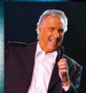
November 19th Righteous Brothers' Bill Medley 7:00 pm Tickets: $30/$36