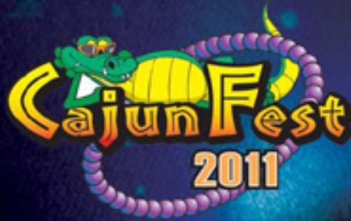
August 18th - 20th CajunFest 11:00 am - 10:00 pm FREE!