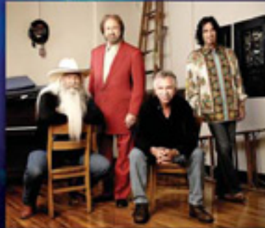
July 22nd Oak Ridge Boys 4:00 pm & 7:00 pm Tickets: $23/$29