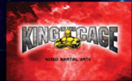
August 6th King of the Cage - MMA 7:00 pm Tickets: $29/$38/$47