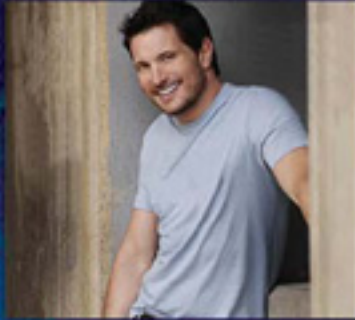
June 27th Ty Herndon 7:00 pm Tickets: $16/$22