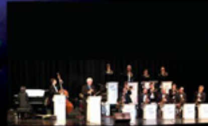
September 17th Artie Shaw Orchestra - Dinner/Dance 6:00 pm Tickets: $40