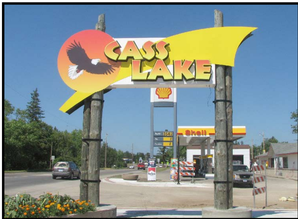
Cass Lake's Streetscape Project nears completion as most streets are almost ready to be paved and downtown Cass Lake will reopen again with modern streets and flowers and trees. The new Cass Lake sign pictured above is located coming into Cass Lake from Hwy. 371 and another identical sign is located at the stop lights coming in on Hwy. 2.

First LaRose Administration Campaign - continued on page 2