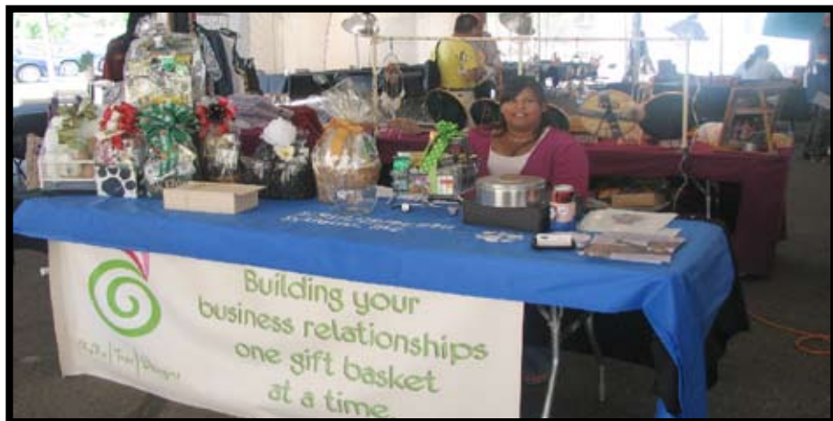
Several vendor booths were on hand to display their goods and information to interested summit participants.