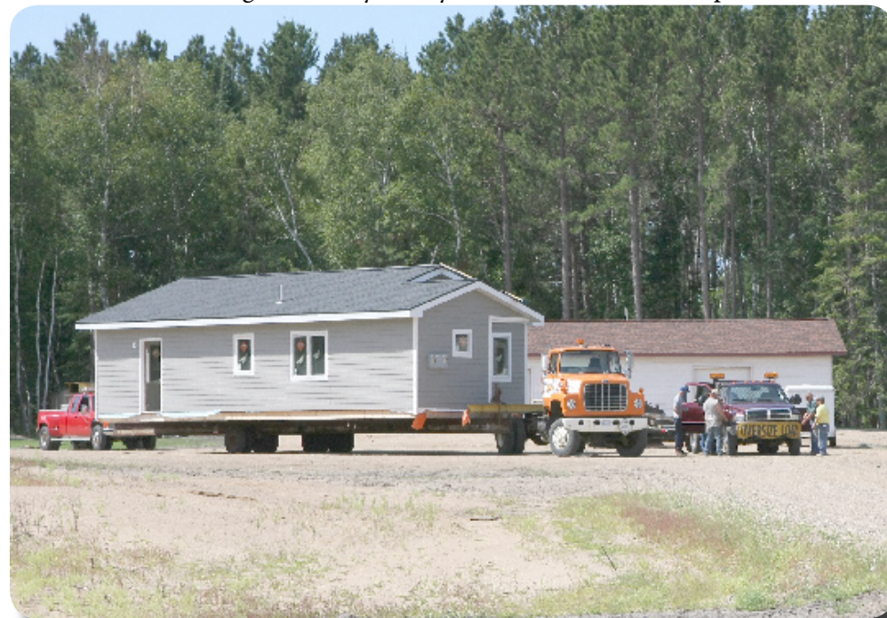
This home was built by Leech Lake Tribal College students and was moved to Red Lake ready for some lucky family to move right in.

Two new houses built by Leech Lake Tribal College students have been transported to the Red Lake Reservation, helping the Red Lake Nation meet its need for affordable housing. One of them is already home to a family, and the other is on its foundation, waiting for a lucky family to move in. The 1152 square-foot houses