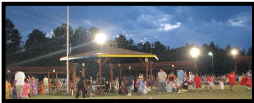
Leech Lake Labor Day Pow-wow 2007