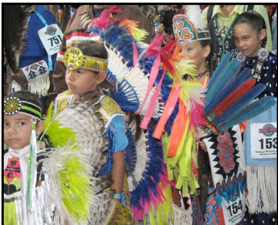
Children dressed in beautiful regalia dance in the Grand Entry at the National Pow-wow in Washington, D.C.

PRSRSTD U.S. Postage PAID Bemidji, MN Permit No. 68