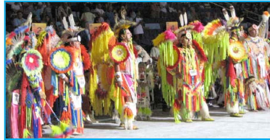
National Pow-wow 07 - Verizon Center, Washington, D.C. August 10-12, 2007