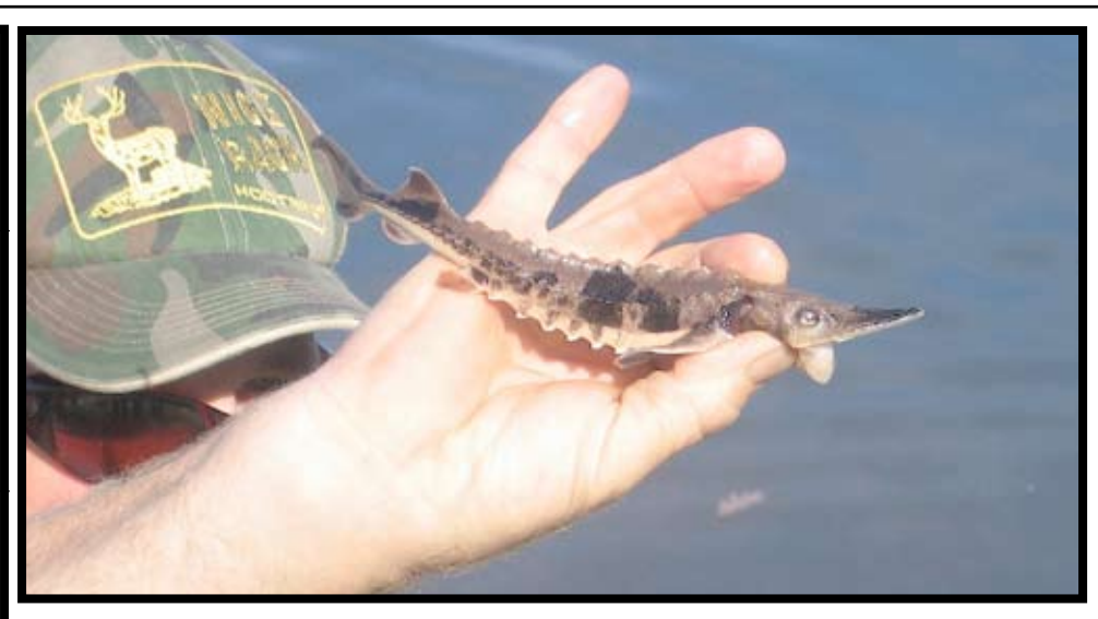
A six inch sturgeon that can grow up to six feet long.