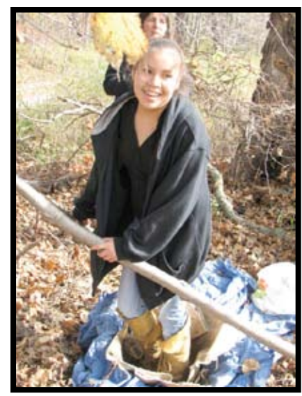
Step 3: Jigging: