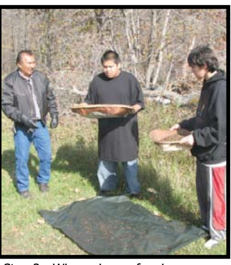
Step 2: Winnowing or fanning: