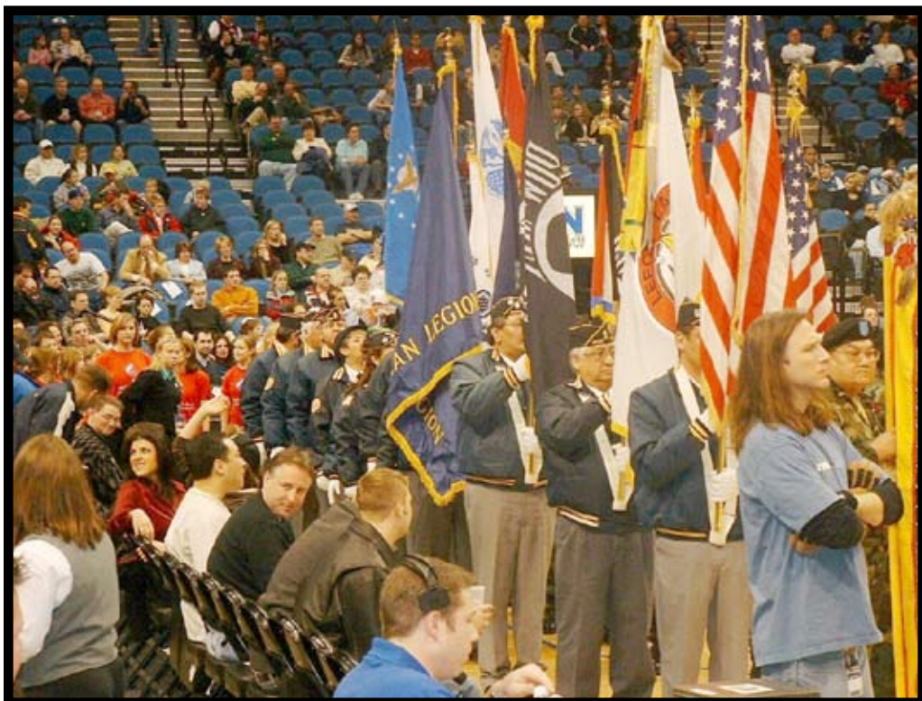
The Leech Lake Honor Guard presented the flags at the Native American Heritage Night at the Timberwolves Target Center game on February 15, 2006.