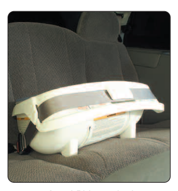
Angel Ride car bed