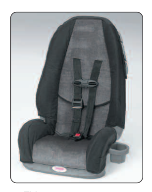
This car seat converts to a booster by removing the harness and rerouting the safety belt.

Use until child outgrows it — when the top of the ears reach top of the seat, when shoulders are above the top slots, or when child reaches the upper weight limit, check the instructions. Children are ready for a booster seat when they outgrow a forward-facing restraint.