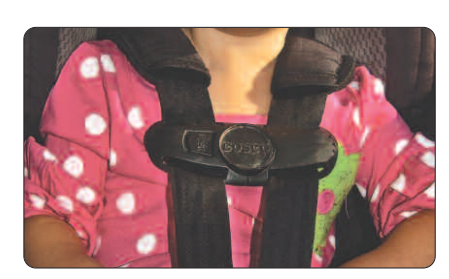
Plastic harness retainer clip should be at child's armpit level.