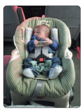
Spaces filled with cloths