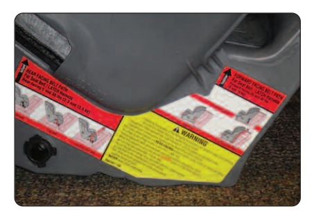
A warning label on a child restraint.