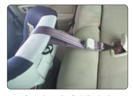
An anchor option for tether hook