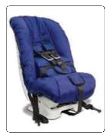
Hippo car seat for hip spica cast