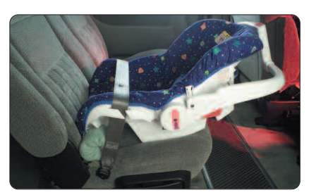
Rolled towel for angle when using seat without the base.

A new baby needs support. To fill empty spaces and give support, roll up a couple of small blankets and tuck them in on each side of your baby's body and head. If the baby still slides down, put a rolled diaper between the legs behind the crotch strap. Never put padding behind or under the baby.