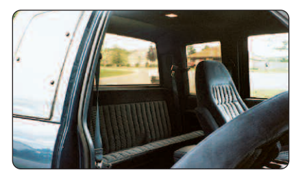
A rear bench seat of a pickup truck.