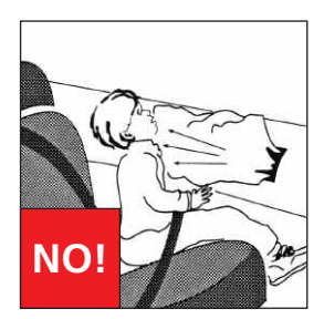
Improperly restrained and unrestrained occupants can be severely injured by a deploying airbag.