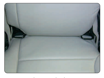
Lower anchor bars