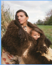
Preventative healthcare for all ages

From women's health, prenatal to postpartum, well child checkups, im-