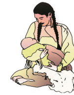
Breastfeeding reduces the risk of diabetes