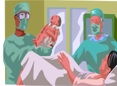
Personalize your birth