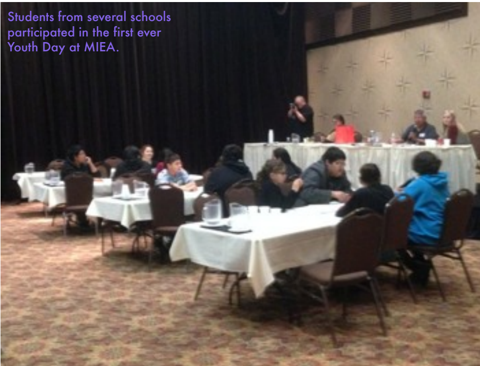
Students from several schools participated in the first ever Youth Day at MIEA.